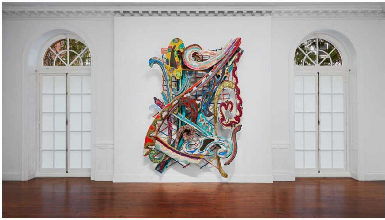
Installation view of Frank Stella: Indian Birds at Mnuchin Gallery, October 4 - December 9, 2023. © 2023 Frank Stella/Artists Rights Society (ARS), New York.