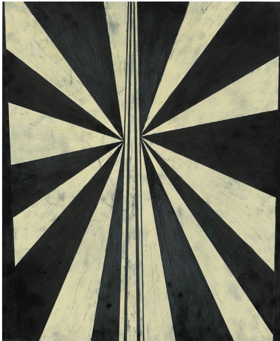
MARK GROTJAHN Untitled (Black/Cream) 2004 colored pencil on paper 17 × 14 inches (43.2 × 35.6cm) signed and dated (verso)